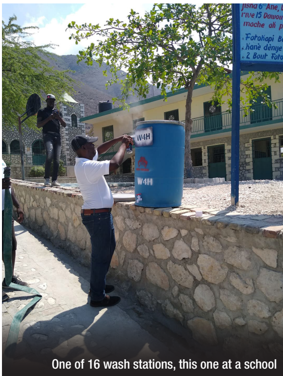
One of 16 wash stations, this one at a school

Each area has its own 'mayor'. The mayors came to W4H and said, "You are the only ones who can help us, will you help?" Each mayor purchased a plastic 50 gal. barrel and installed a spigot and set in their area. They asked if we would keep the barrels full of water so the people in each area could wash their hands, a novel idea in a meat market. We naturally said yes and started to deliver water 3 times a week to the barrels. We had already purchased 26 five gal pails and installed spigots for the same purpose. After the route is completed, the team heads out for the afternoon of normal close by well repair. We provided Clorox and soap and even gave seminars in the proper way to wash one's hands. We will continue this service until the crisis has passed.