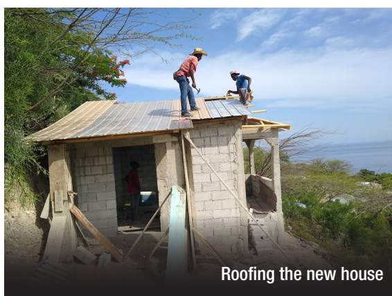
Roofing the new house