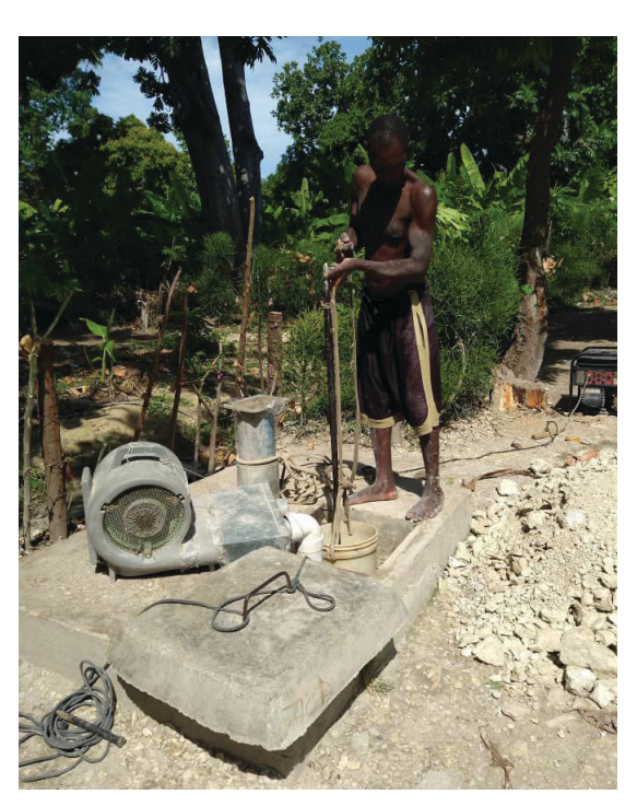
A fan set up to blow air to the digger

Back to the 23 days of not being safe to be on the road, the gangs are and were fighting for territory and they seem to just come and go for different periods of time. When several gangs come into our town, people just go to their homes, lock the doors and stay for several days. One such trip, 30 homes were burned for no reason at all. But during all of this dangerous environment , they were able to repair 76 pumps, cleaned 4 wells, dig one new well and set the pump and deliver 56 loads of water to approximately 56,000 people. One reason for the many loads of water is that this is one thing they could do if the roads were blocked. Instead of just staying home they delivered water to local neighborhoods inside of the town.