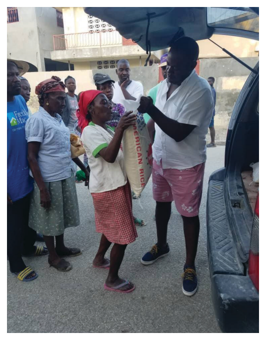
Handing out supplies to hurricane victims

I want to thank you if you are reading this letter. That means you did not just trash it without even opening it. I am sure like most people I receive daily 4-8 letters from good charitable causes asking for donations. So thank you for taking the time to open and read Water4Haiti's Story every 3 months.