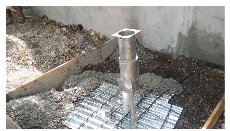
One more new pump being installed

I want to thank you if you are reading this letter. That means you did not just trash it without even opening it. I am sure like most people I receive daily 4-8 letters from good charitable causes asking for donations. So thank you for taking the time to open and read Water4Haiti's Story every 3 months.