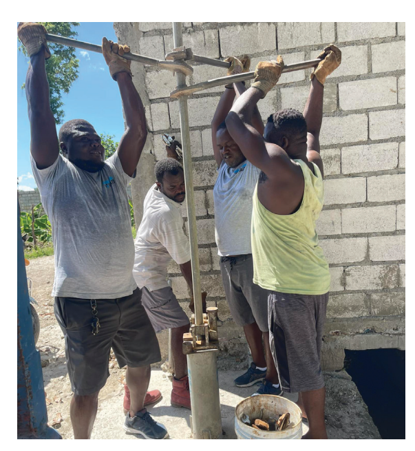
Repaired nearly 3000 pumps in 15 years

Since the first of the year the fellows have not been able to go to work for a total of 23 days and I am sure some of those trips were questionable. Along with this we have had to "make do" with what we had in inventory. They would go to the used pipe rack and cut out the bad parts and thread the ends and put two pipes together to make one "new" one. Another drilling organization, Water for Life, allows us to order with them as we could not afford a complete load of pipe from India on our own. Two containers arrived from India with the pipe and pumps two months ago and customs has yet to release them. Their excuse is, wrong paper work, shortage of men, gang violence, lost paper work and last week they made them unload both containers there on the dock, looking for contraband. To add to all of that we are being charged $100 a day because our container as been on the dock too long as we have not picked it up. "Oh, Isaiah where are you?" Give us strength to endure the frustration and maddening attitude to endure this situation. Strictly a shakedown and one know customs will be at a premium.