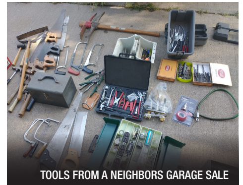
TOOLS FROM A NEIGHBORS GARAGE SALE