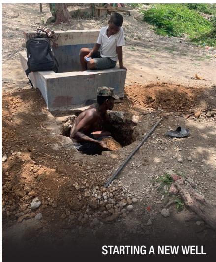
STARTING A NEW WELL

a pail on a rope which his partner then pulls up hand over hand. A well like this would cost $200-$300 plus we furnish one meal a day.