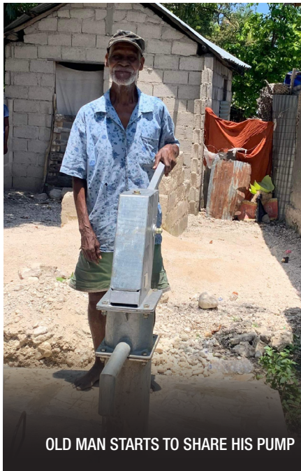
OLD MAN STARTS TO SHARE HIS PUMP

Yes, another 3 months have passed in our lives. We all have experienced or know someone who has dealt with hurts and joys along with deaths and new births. As Matthew 11:18 says, quoting Jesus, “Come unto me, all who are weary and heavy laden and I will give you rest”. Summer in Haiti comes