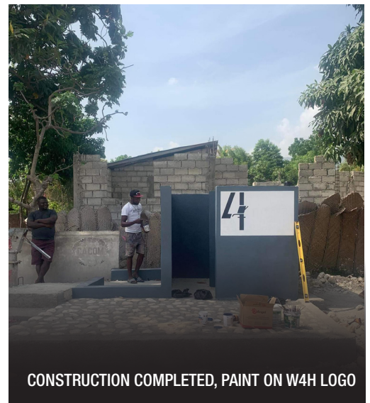
CONSTRUCTION COMPLETED, PAINT ON W4H LOGO

Occasionally we send boxes of repair parts, small supplies, etc. This time we included several dozen pairs of work gloves and half a dozen of Bibles in Haitian Creole language. Some of the gloves were given to people in our neighborhood who pound rocks for a ‘living’. They get rocks from the river, about the size of a bowling ball and proceed to sit all day and crush the rocks into stones small enough to use in running cement. The pile just keeps growing as they pound away. A large pickup load would bring about $200. What would you rather do for $200. Dig a well or pound a pile of rocks?