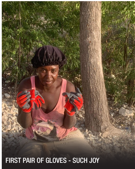
FIRST PAIR OF GLOVES - SUCH JOY

This is the first letter in a long while that I have not started out sharing with you the economic and dangerous issues. Well, they have not improved. No fuel for a week, shootings and gang violence. One dollar today is now worth 50 cents. The Haitian people are so resilient and take all of their misfortunes as part of living. We could probably take a few lessons from them in how we are now having to deal with our shifted way of life. Deu. 31:8 assures us that "The Lord himself goes before you and will be with you; he will never leave you nor forsake you. Do not be afraid; not be discouraged".