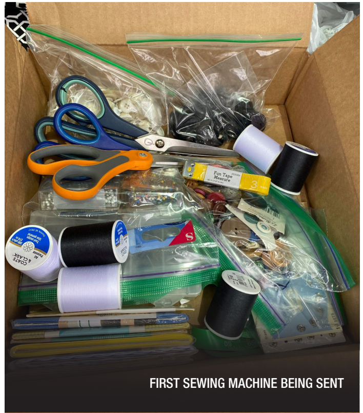
FIRST SEWING MACHINE BEING SENT

During this past year we have launched several worthy projects. One was getting that family off of the mountain who were living in a corn stalk lean to. You people donated for a new block home, land and all $5000. Then the mother dies giving birth to her 8th child. You responded with love to help feed and clothe this one day old baby. Now we have mentioned a project that 4 people have responded to and that is sending down a sewing machine they no longer use. Electricity is slowly coming into the city so they will find an outlet somewhere. All children in school, K-12 must have an approved uniform for their school, so thousands of outfits must be sewn each year. One has been shipped and it will be exciting to send pictures to the donor of her old machine.