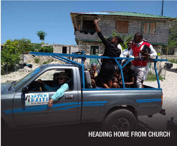
HEADING HOME FROM CHURCH