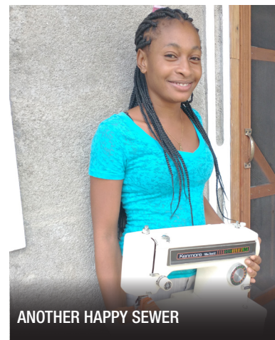
ANOTHER HAPPY SEWER

With being out of pipe we are very fortunate to have a generous well driller located 20 miles from us. He had waited 13 months for his container of pipe and he loaned us 50 lengths until we received our order. Each year during the dry season we get many calls that our pump is broken. Many times the water table has dropped and extra pipe needs to be added. If the well is dry, and hand dug, we bring one of our digging teams who enter the well and dig lower until they hit water. Since the beginning of the year we have cleaned and lowered 9 wells, repaired 38 and delivered 30,000 gallons of water to needy communities. These actions benefited over 15,000 people. Another project started last year, is giving qualified ladies a donated sewing machine. These ladies are in a 2 year sewing class and must have access to electric power. Over a dozen have arrived from compassionate women but with the increase of shipping costs I am afraid this project will eventually come to a close.