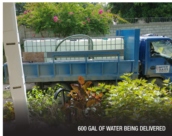
600 GAL OF WATER BEING DELIVERED

This was one of first major projects 12 years ago. It had started to leak and delivering water was becoming a waste of time, water and fuel. So we hired a cement “specialist” to patch the cracks where tree roots were invading. We then delivered 6000 gallons to partially fill, as the roofs of a school and church are piped into it. When the rains start it will be a blessing for everything and everyone as Haiti needs rain!