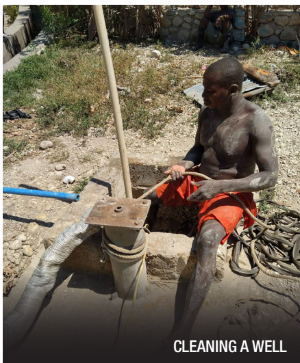
CLEANING A WELL