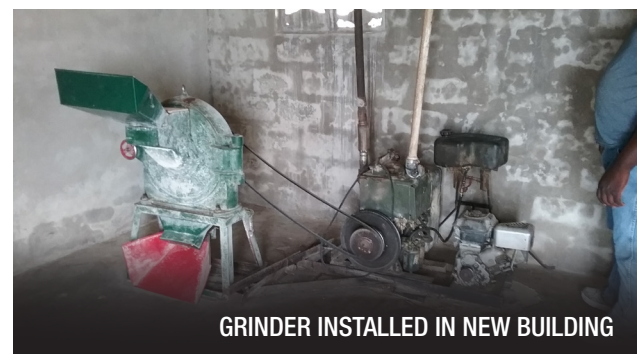
GRINDER INSTALLED IN NEW BUILDING

Also in Ivwa was a very large beautiful spring at least 3’ across. Someone years ago had built a concrete, cover box over the spring 20’ x 20’ and installed 3 shallow pumps. It was like a box turned upside down. Well, after years of pumping, water always spills around a pump and here the hogs had mud wallows