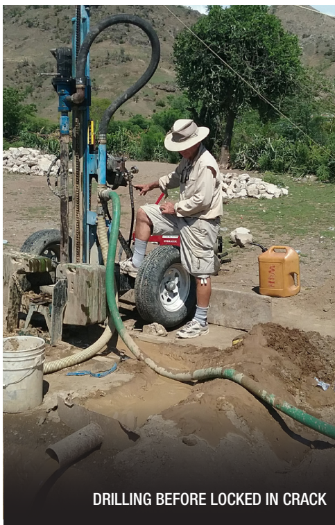
DRILLING BEFORE LOCKED IN CRACK

Dear Friends, Romans 16:20 tells us, “The God of peace will soon crush Satan under your feet. The grace of our Lord Jesus will be with you”. There is no doubt that Satan has had a hold on Haiti for many years. This year has been no exception if not a bit worse. These past 8 months the gangs who control the country have ramped up terrorism, kidnappings, murders, robberies, road blocks, just plain destruction of property of others. The country is completely shut down as there is no fuel to be sold. Just like this country, think what would happen if we had no fuel for eight months. The Interstate would be empty of vehicles, walking to the empty shelves of your local grocery store, no electricity, for heat or cooling, no water from the sink faucet. Hard to even think of-but it is happening in Haiti right now. As Thanksgiving approaches, please pause a moment to thank the Lord for our abundance of food compared to the other 90% of the world.