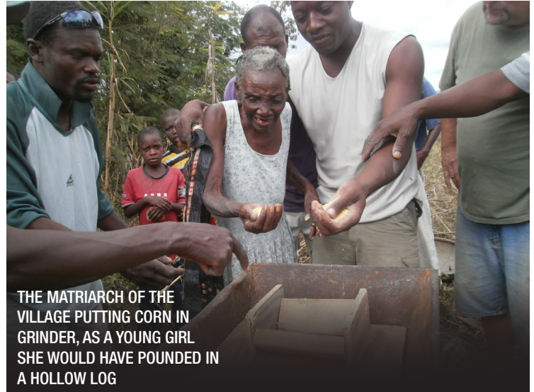
THE MATRIARCH OF THE VILLAGE PUTTING CORN IN GRINDER, AS A YOUNG GIRL SHE WOULD HAVE POUNDED IN A HOLLOW LOG

Have a blessed Thanksgiving and a Merry Christmas